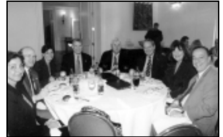
Just a bunch of happy campers!